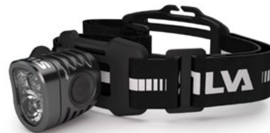
EXCEED 2XT / LIMITLESS EXCEED 2